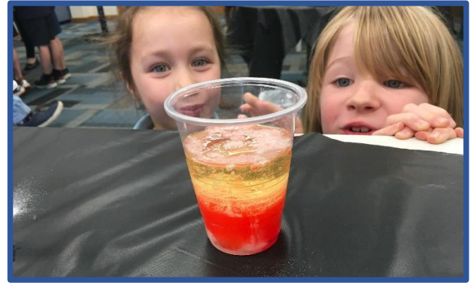
Students made lava lamps.

Sciworld delivered a Chemistry Capers incursion for year ones. Students took part by mixing different chemicals to create a myriad of amazing reactions.