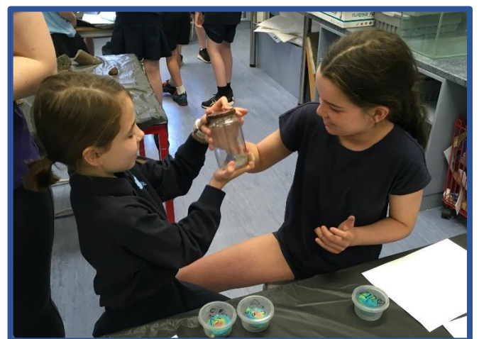
Shaking coloured sugar cubes in a jar to see the effects of weathering.

Year 3/4 had a Geology incursion. Students made a play dough model of the inner parts of earth as well as studying a range of different rock samples.