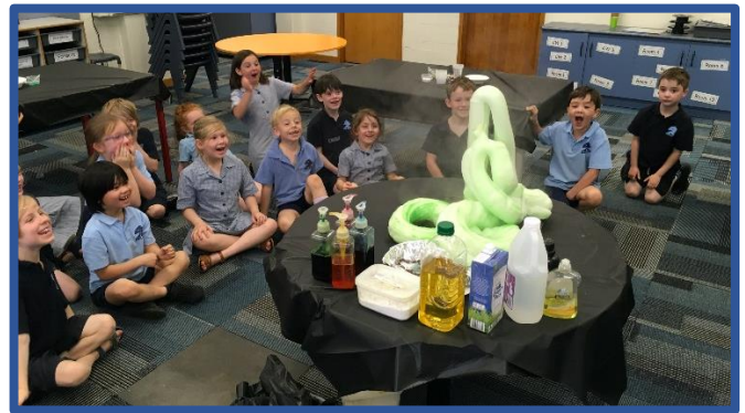
They watched Elephants' toothpaste erupt on a table

Year 3/4 had a Geology incursion. Students made a play dough model of the inner parts of earth as well as studying a range of different rock samples.